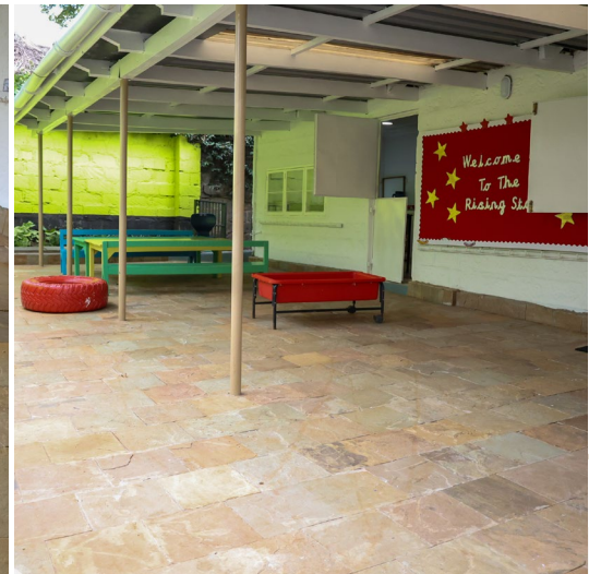
Nursery 2 and Rising Stars also got Mazeras on their verandas