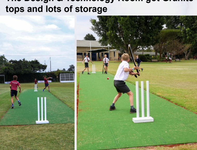
The team laid new cricket wickets and revamped the cricket nets