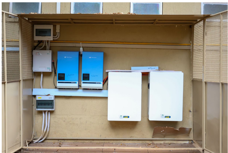
A new 20KvA solar installation that's now taken the whole of the Lower School and Kitchen off-grid