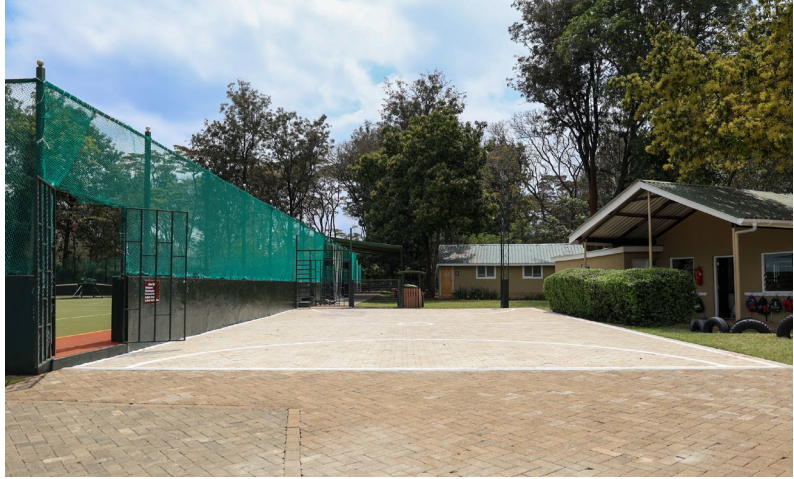
New Cabro was laid in the Lower School (between the Astro and 1LR class room)