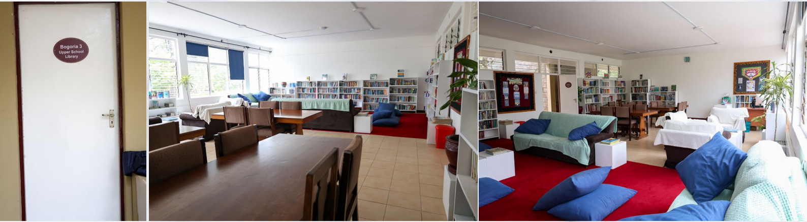
Upper School Library moved downstairs to increase accessibility

Our Maintenance Team have been incredibly busy over the holidays, improving, renovating and repairing our facilities, so that pupils can derive maximum benefit from the different learning environments around the school.