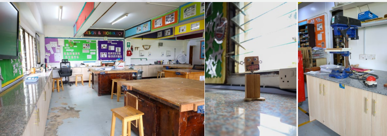
The Design & Technology Room got Granite tops and lots of storage