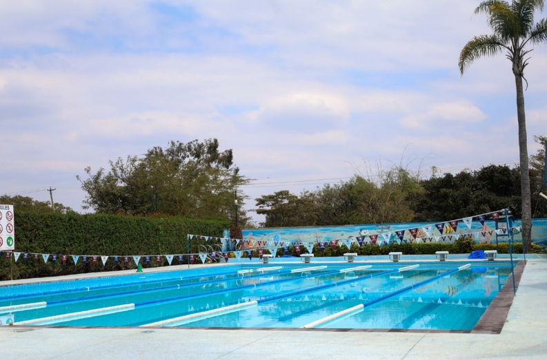
A natural stone lip around the Swimming Pool