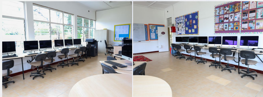
Renovation of Upper School ICT Suite