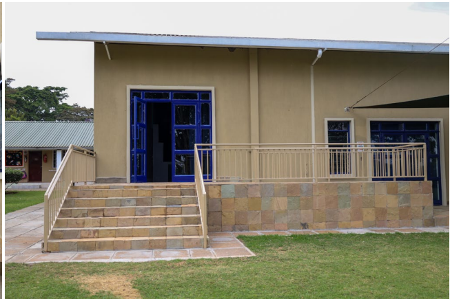
The Main School Hall got extended